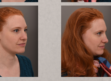
Tip of nose angled past cheek