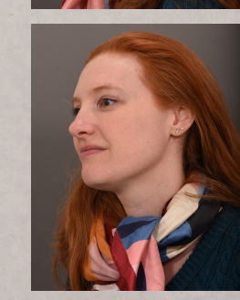
Head angled up & back