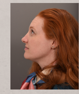
Looking up, chin not parallel to floor